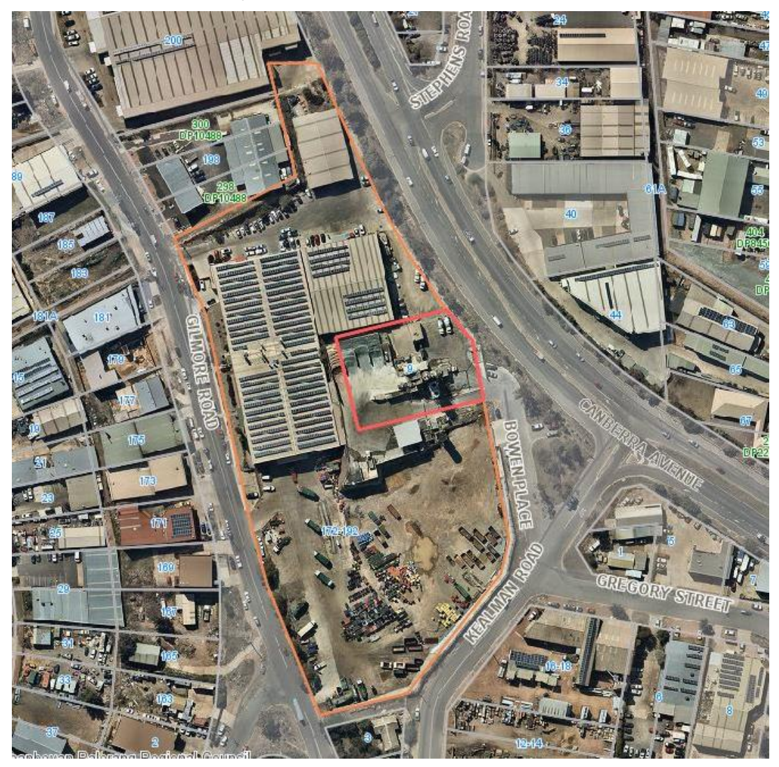
Figure 1 – Subject Site – Lot 10 outline in orange. Lot 11 (Batching Plant) outline red

Page 6 of the Planning and Strategy Committee of the Whole of the QUEANBEYAN-PALERANG REGIONAL COUNCIL held 11 September 2019.