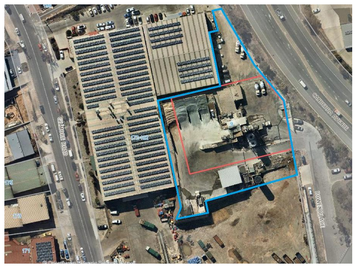
Figure 2 – Extent of Concrete Batching Plant

Figure 2 below shows the extent of the concrete batching plant development and the approximate future adjusted boundaries of Lot 10. The red outline shows the existing boundary of Lot 11. The blue outline shows the extended boundary to encompass the whole of the extended batching plant.