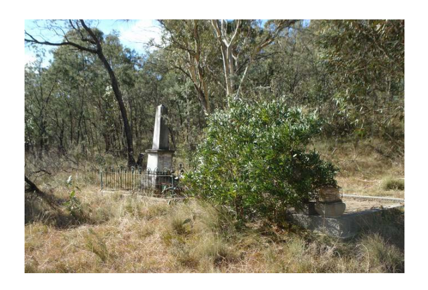
Church of England Section, Captains Flat Cemetery