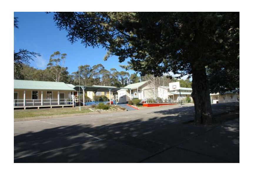
Captains Flat Public School