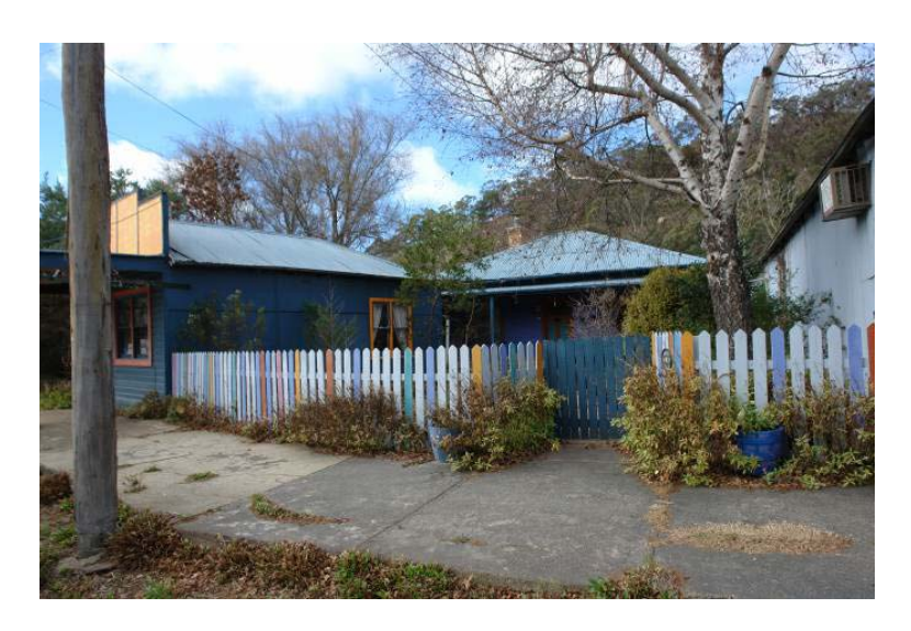
70 Foxlow Street, Captains Flat