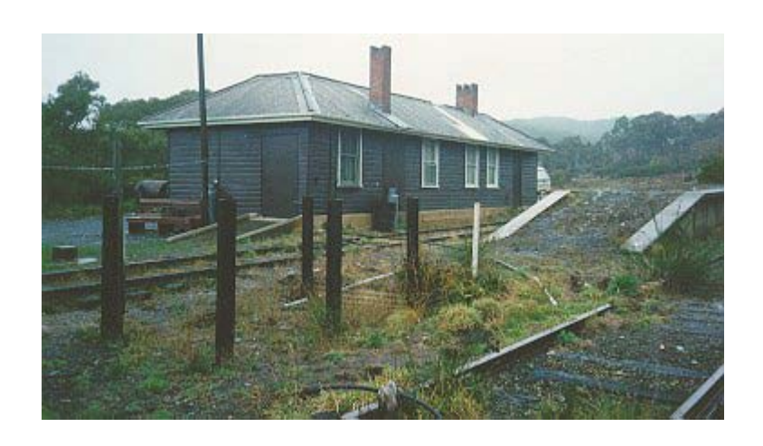
Captains Flat Railway Station