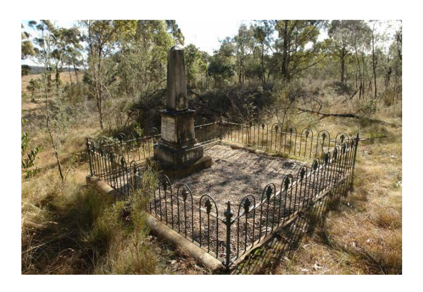
Church of England Section, Captains Flat Cemetery