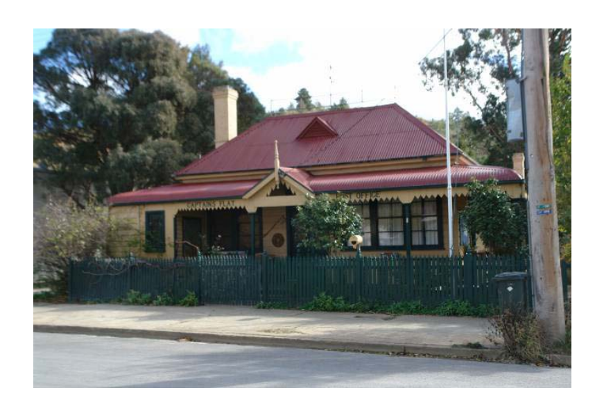
Captains Flat Post Office