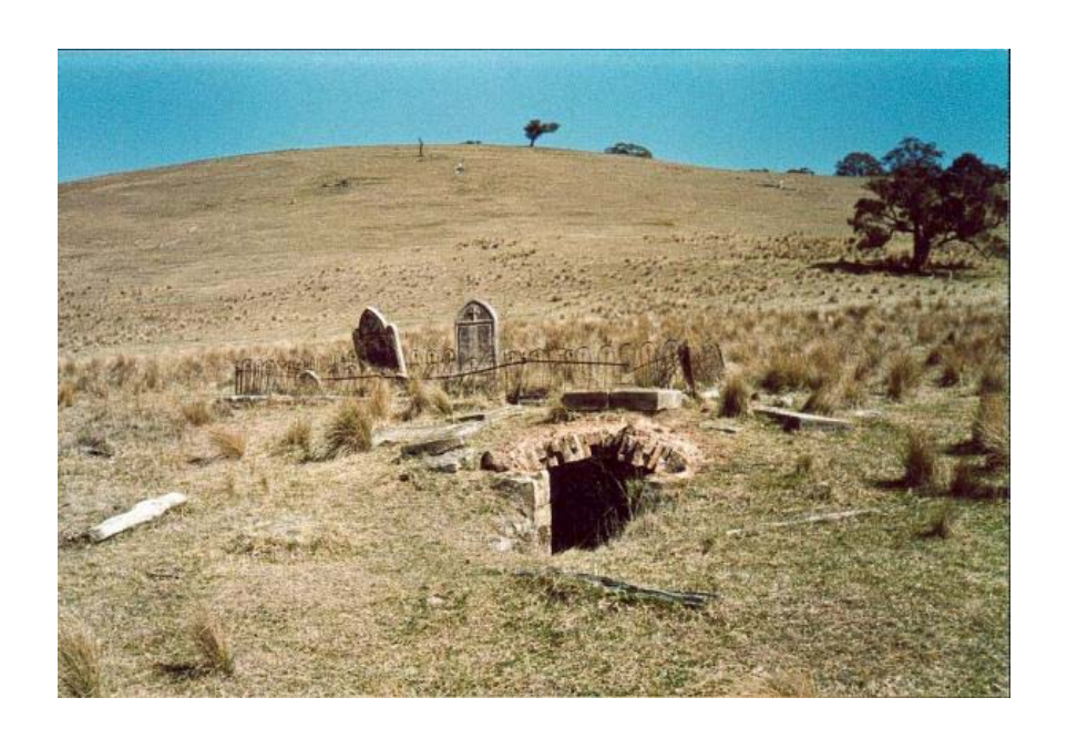
Hyland Cemetery