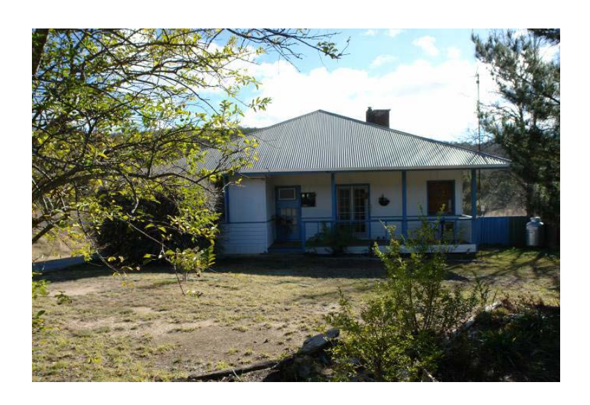
Former Station Master's House