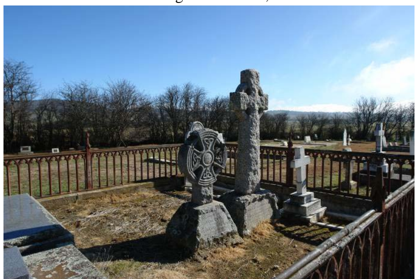
Headstone detail, St Thomas's Cemetery, Carwoola