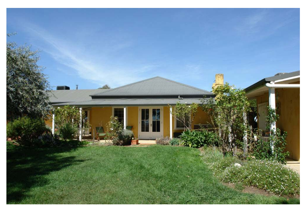
The Old Chinnery Cottage, Bungendore