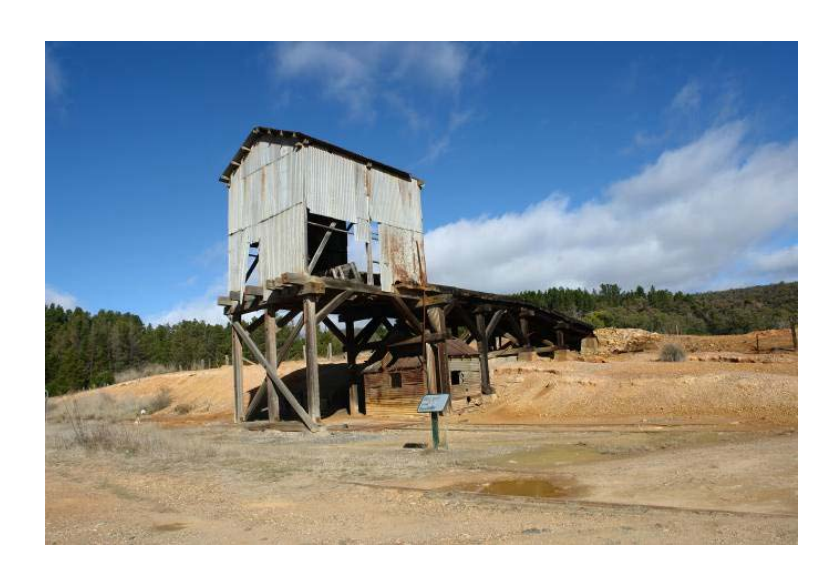
Captains Flat Weigh Bridge