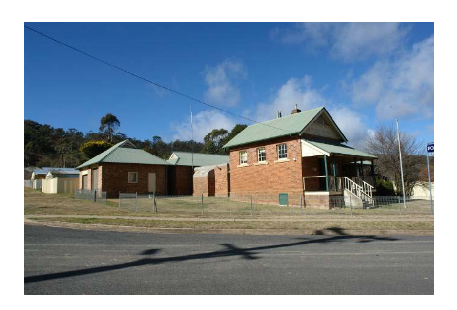
Captains Flat Police Station