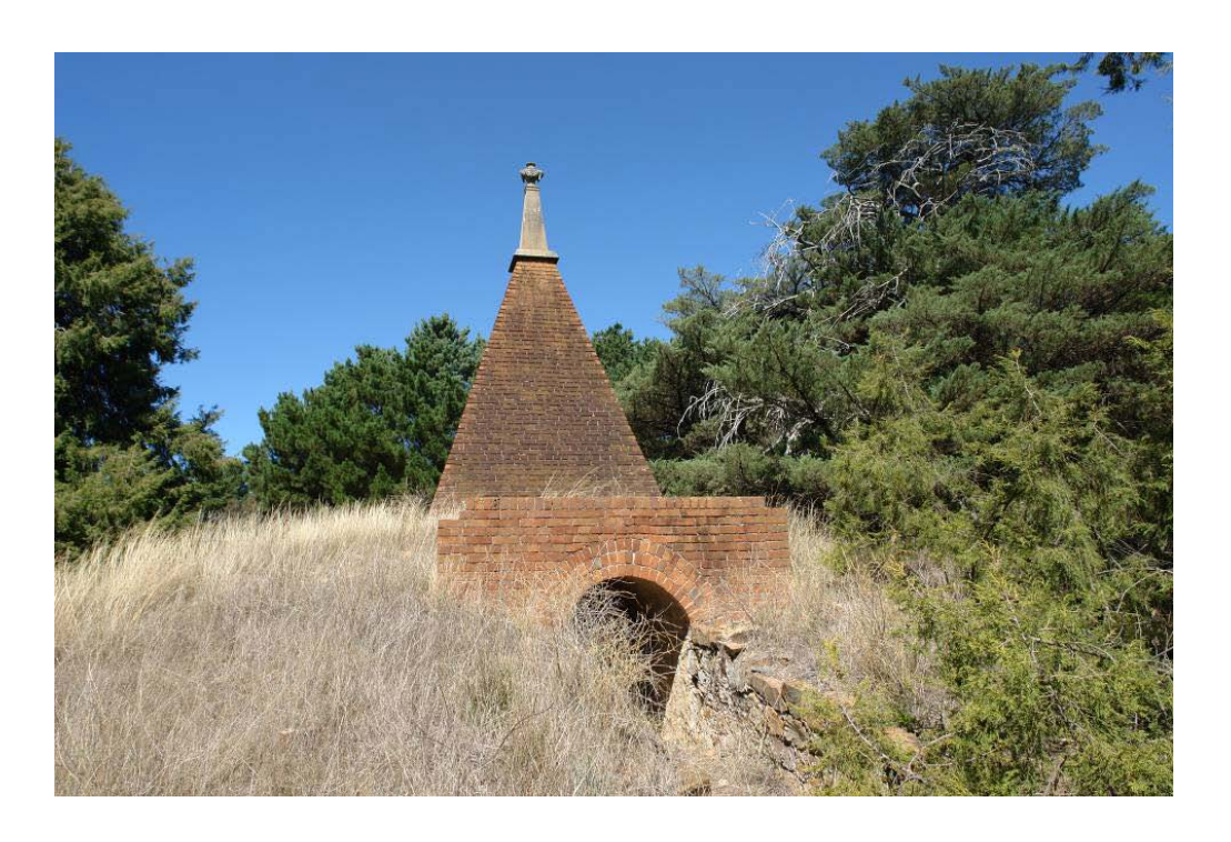
Coopers' Vault, Willeroo, Tarago