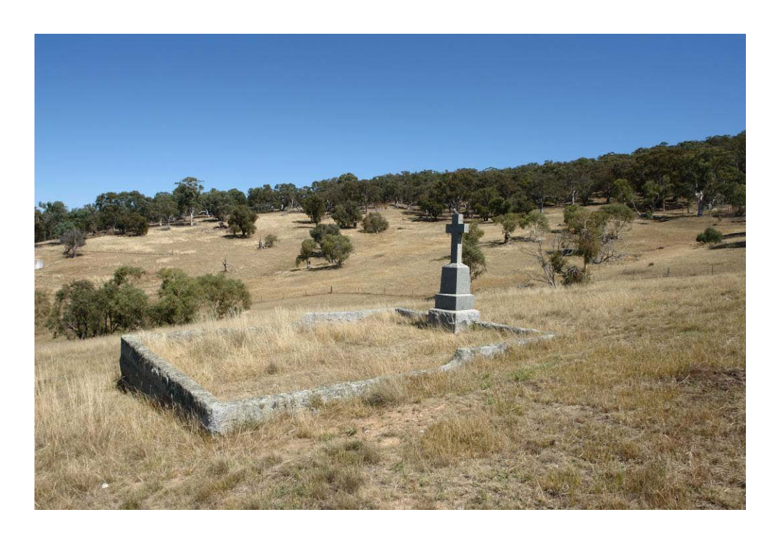
The Briars Cemetery, Amberling