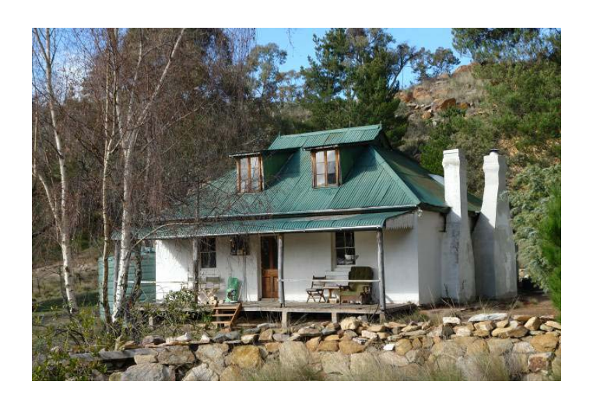
The Bollard House, Captains Flat