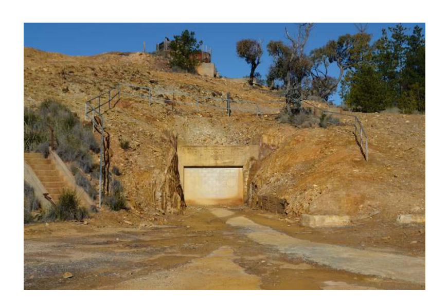
Entrance to Lake George Mine