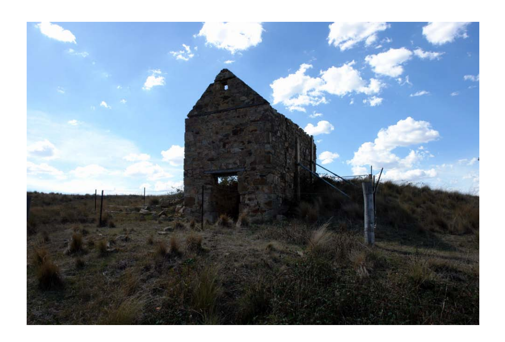
The Granary, Duralla, Bungendore