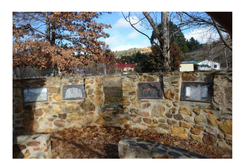
Wilkins Park Miners' Memorial, Captains Flat