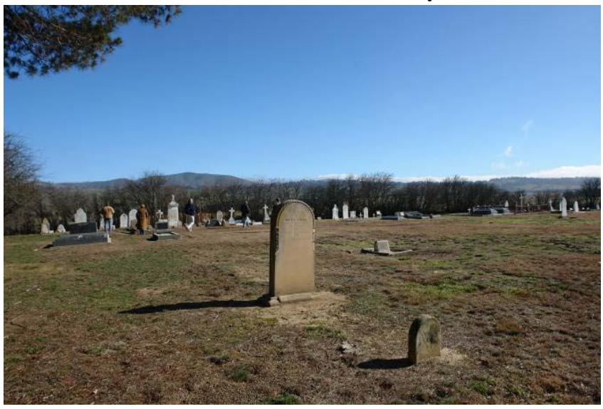
St Thomas's Cemetery, Carwoola