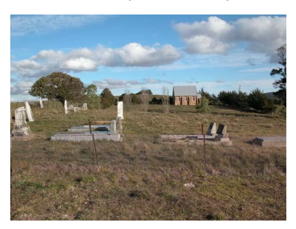
St Matthias' Cemetery, Currawang