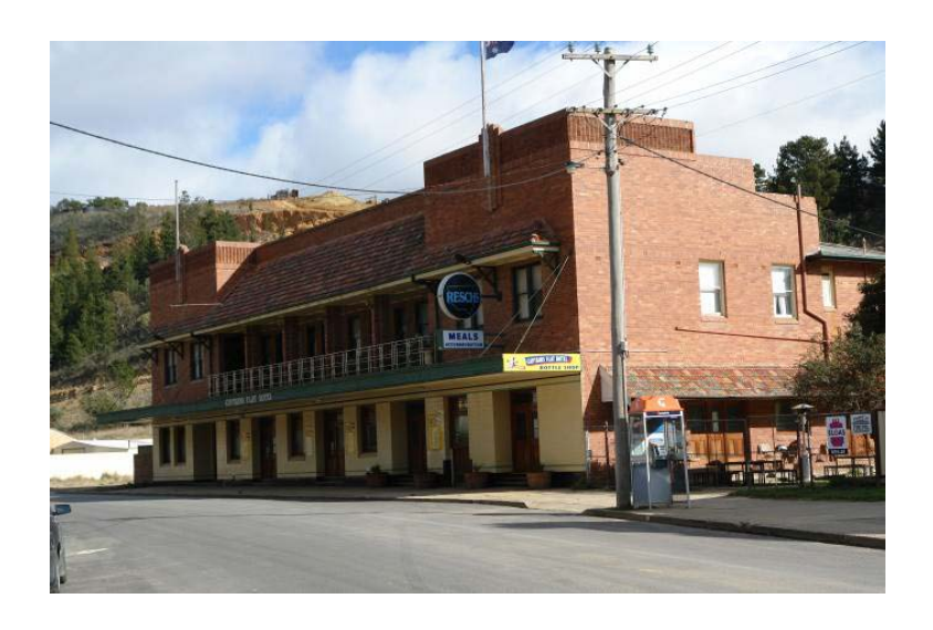
Captains Flat Hotel