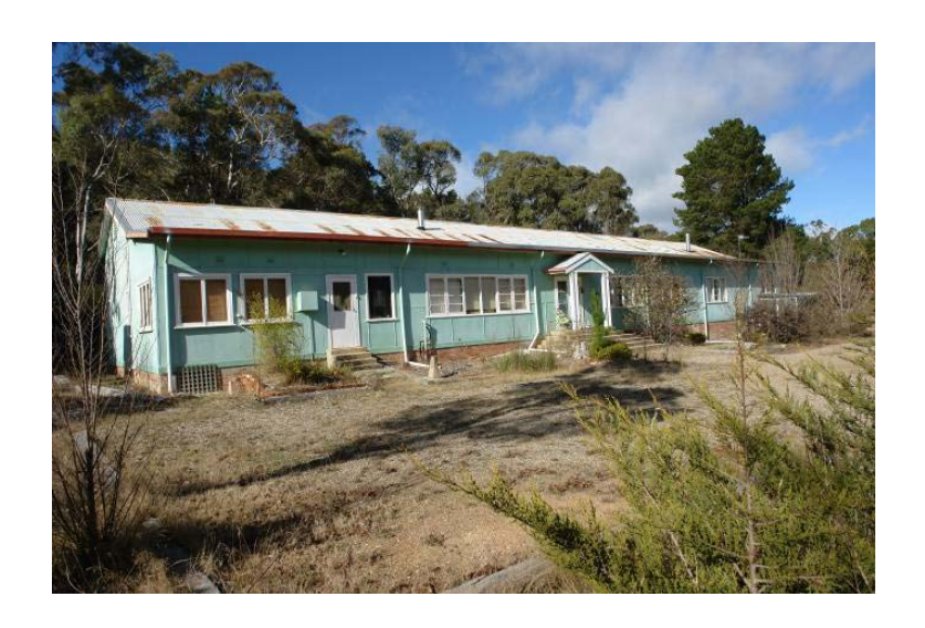
Former St Brigid's School