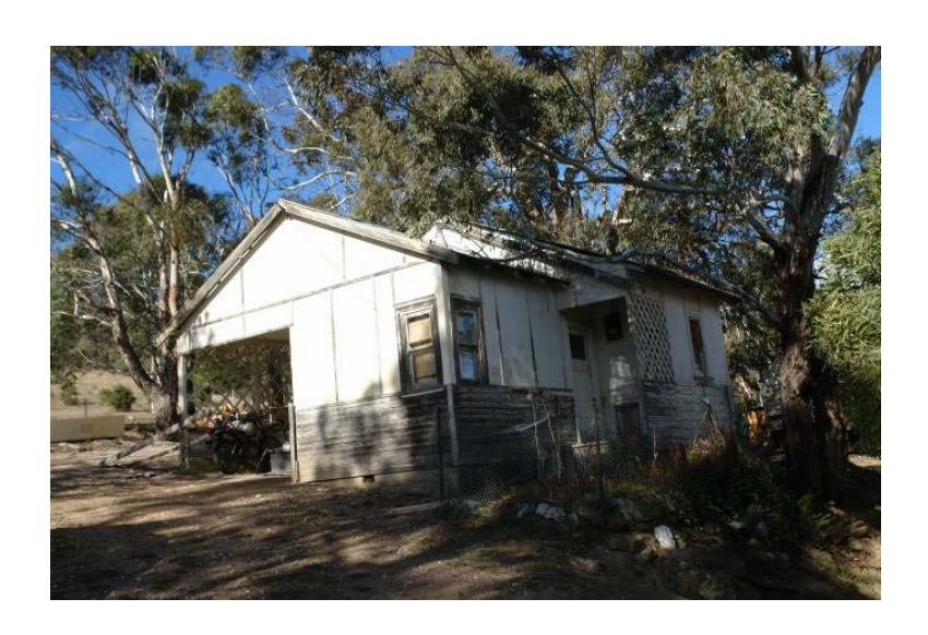
St Luke's Rectory