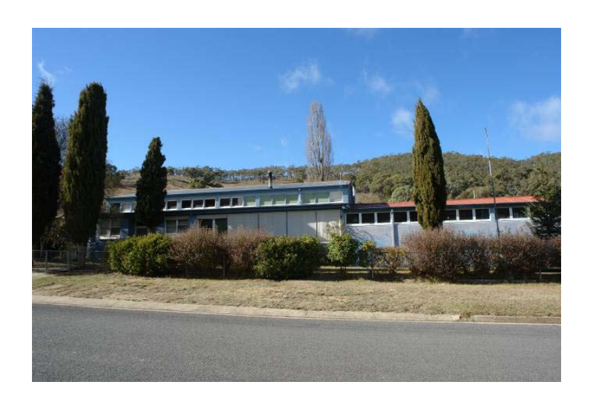
Former RSL Club, Captains Flat