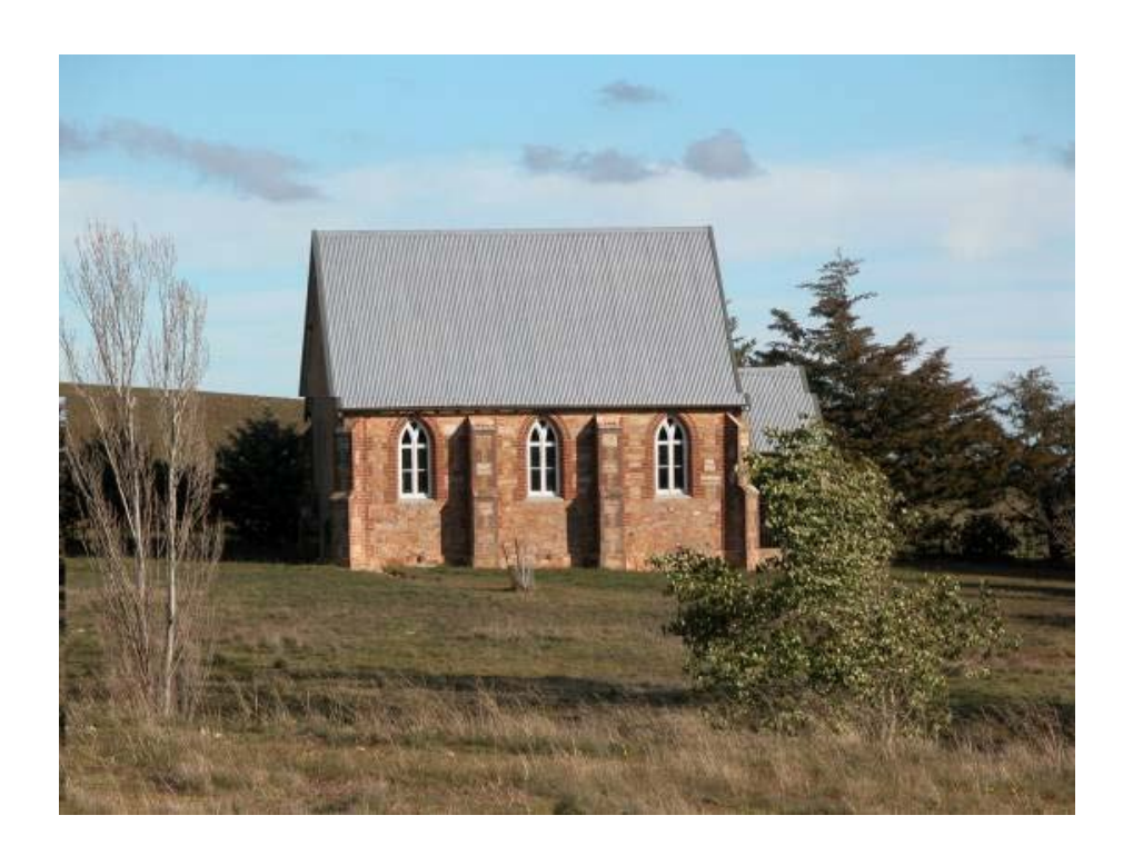
St Matthias' Anglican Church, Currawang