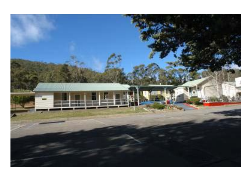
Captains Flat Public School