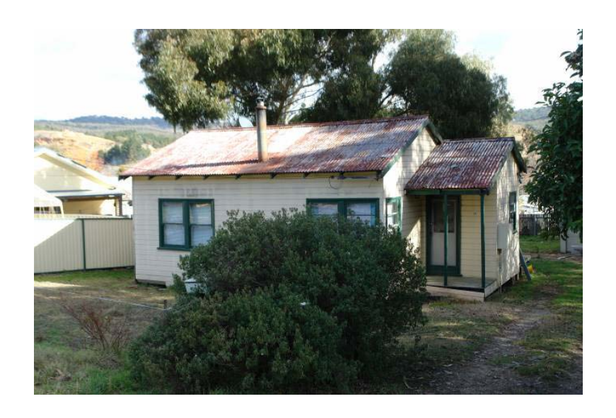
11 Mulga Street, Captains Flat