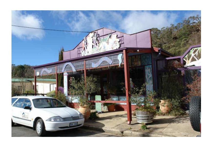
The Outsider, Captains Flat