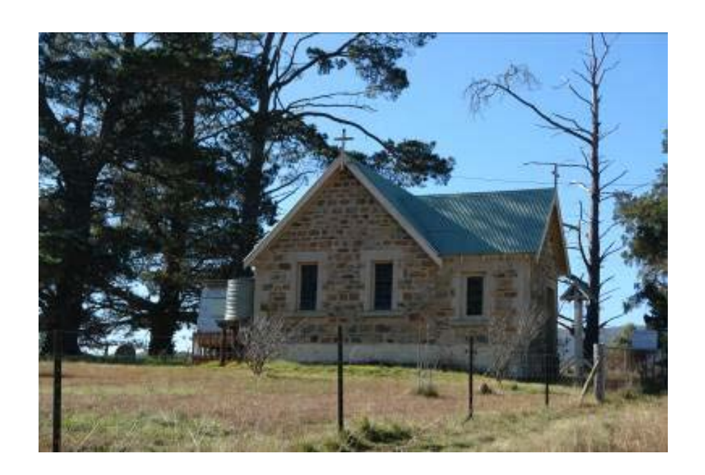
St Mark's, Hoskinstown