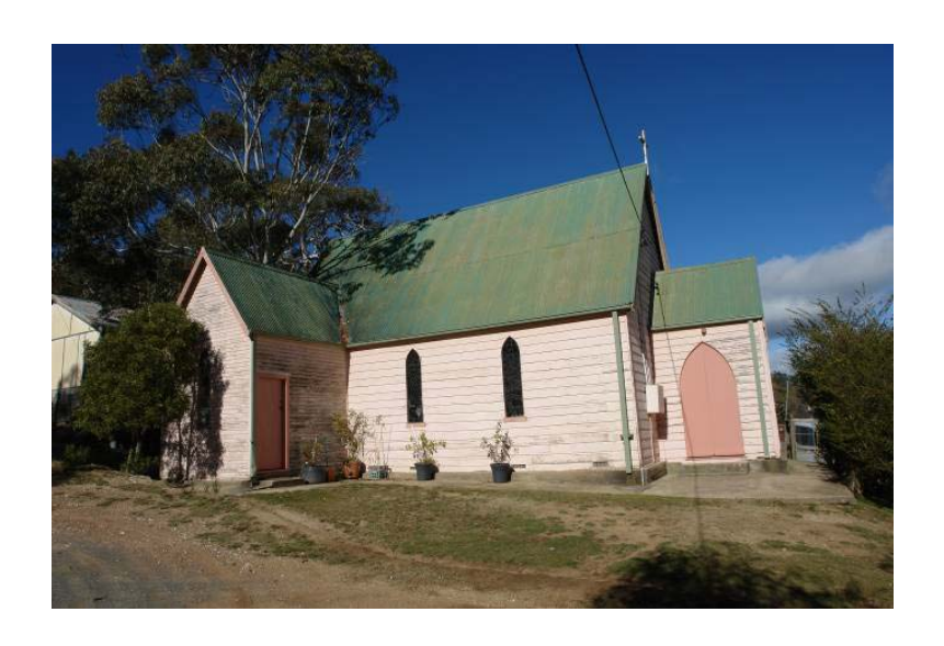
St Luke's Church