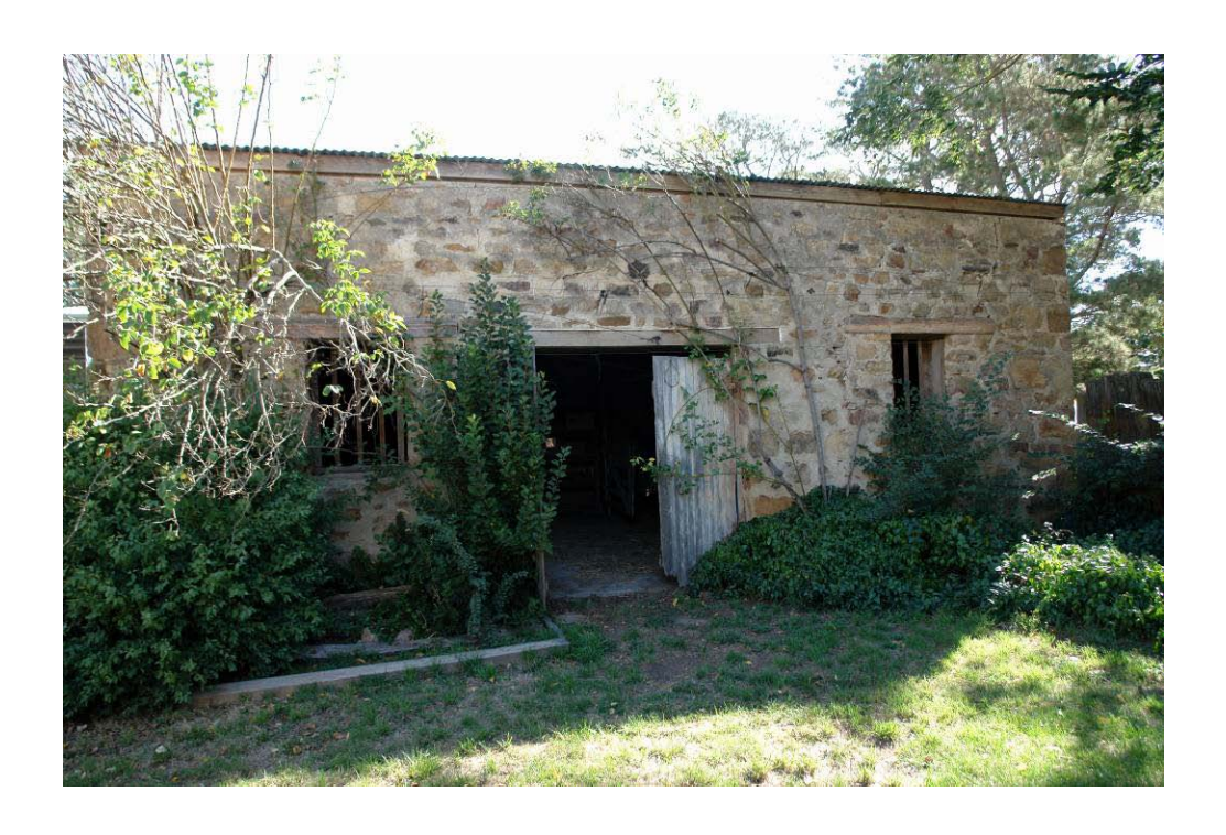
The Stables, Duralla, Bungendore