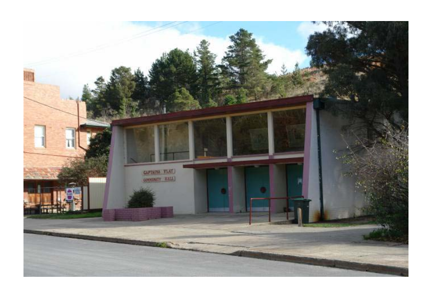
Captains Flat Community Hall