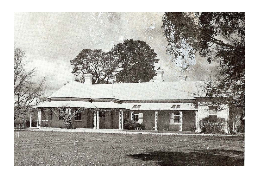
Gidleigh 1975 Historic Homesteads Of Australia p43