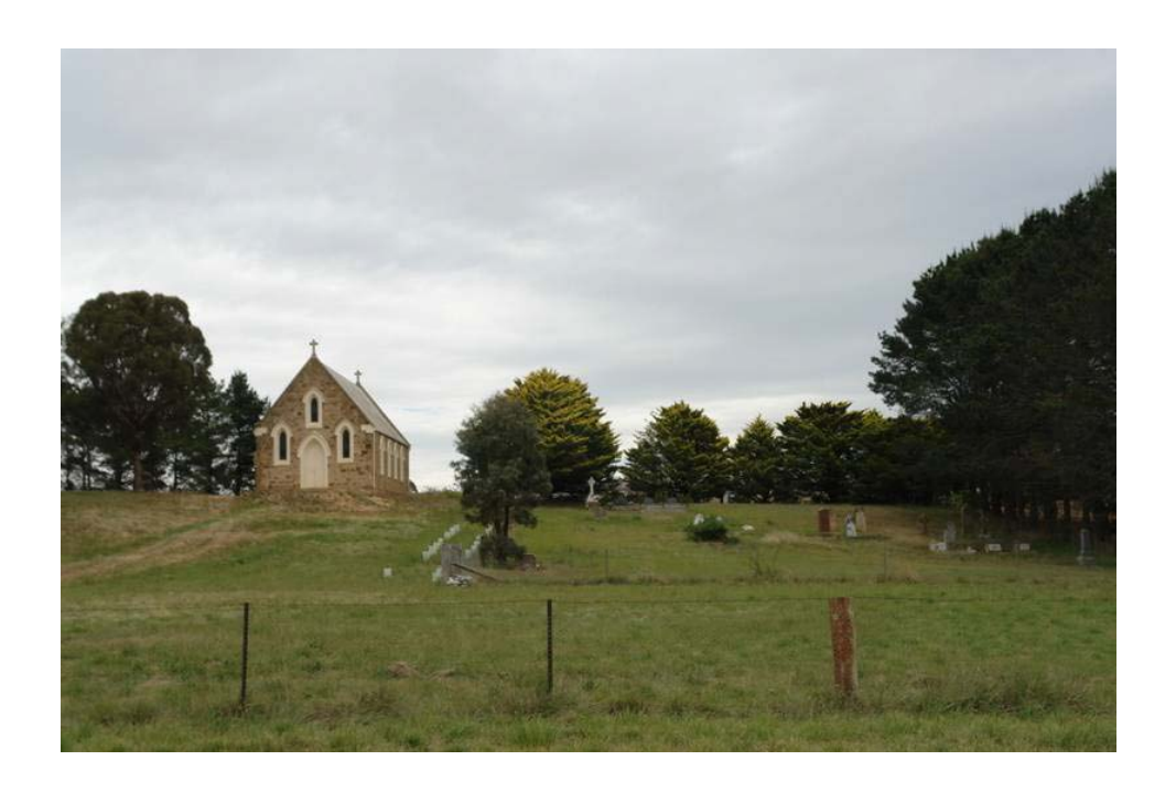
St Peter & St Paul's, Hoskinstown