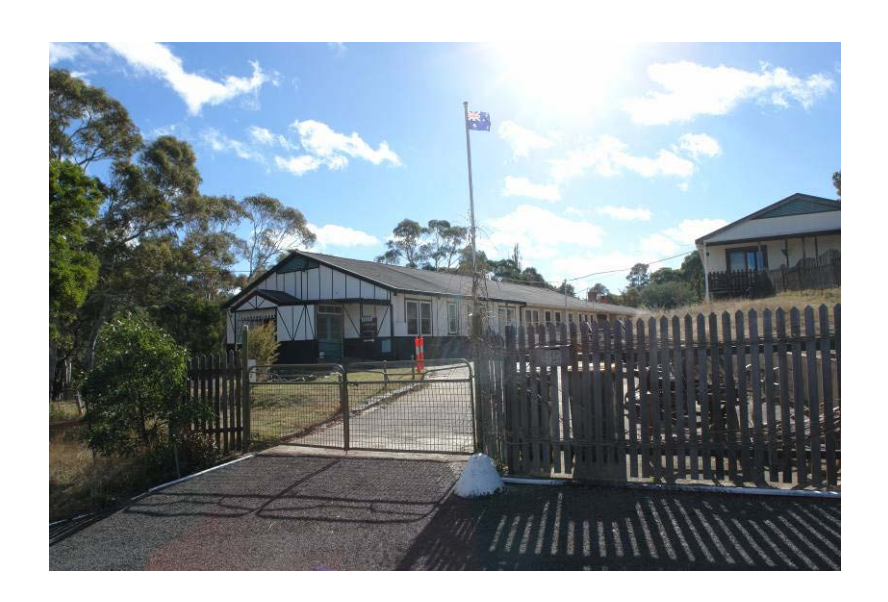
Former Captains Flat Hospital