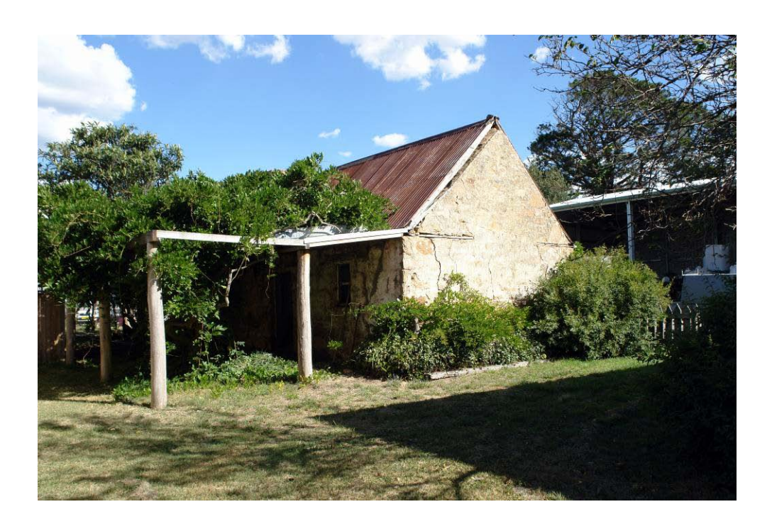
The Currency Lass Inn, Duralla, Bungendore