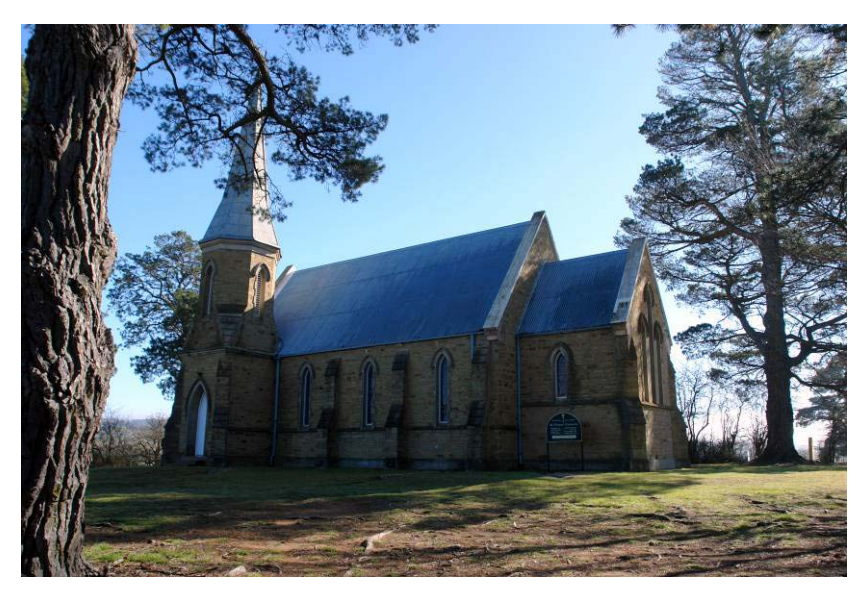
St Thomas Anglican Church, Carwoola