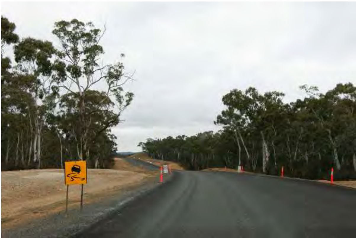
The sealing of Nerriga Rd has continued during the first half of 2019-20.