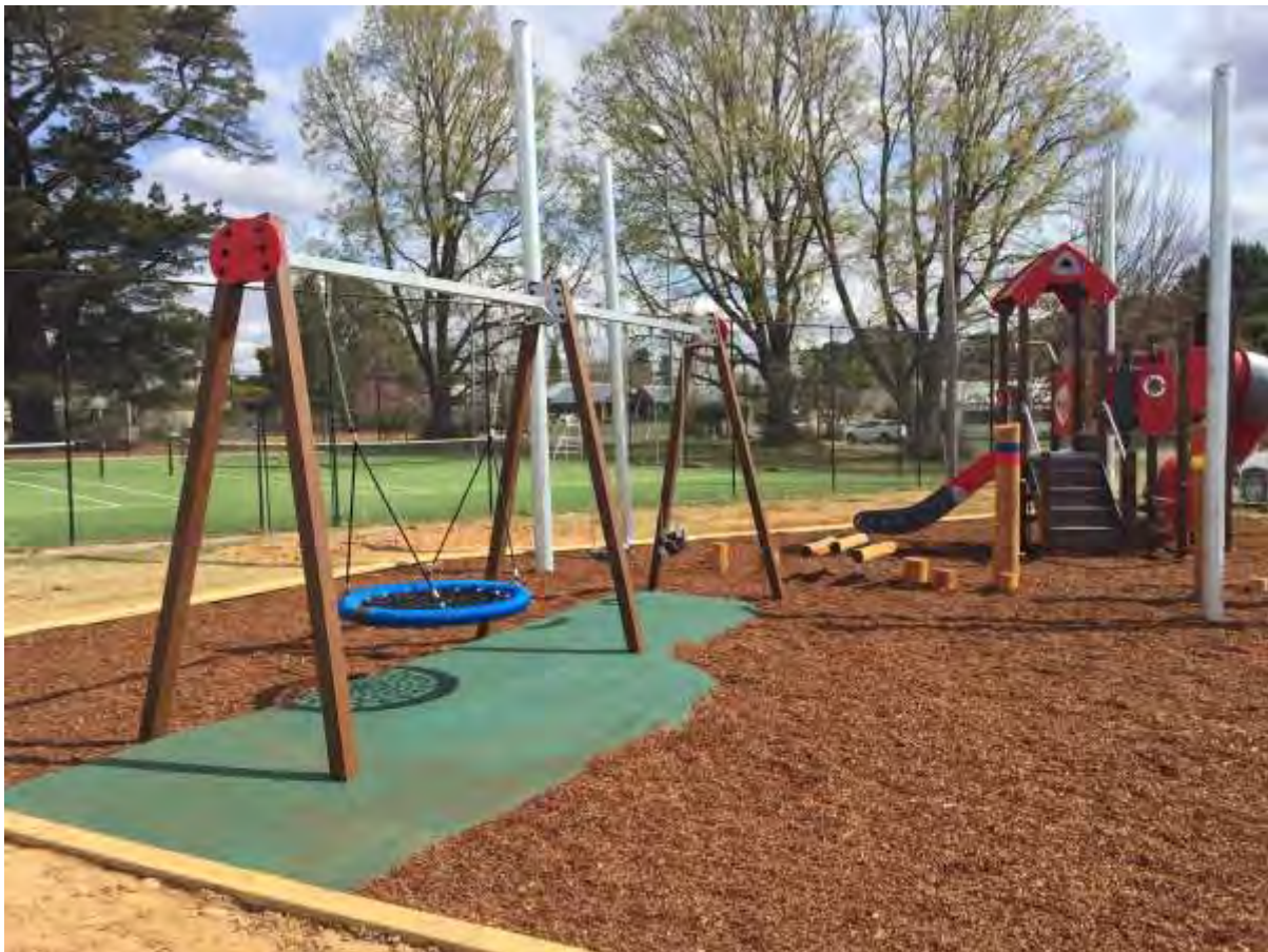
A new playground was installed as part of the upgrades of the Braidwood Recreation Ground.