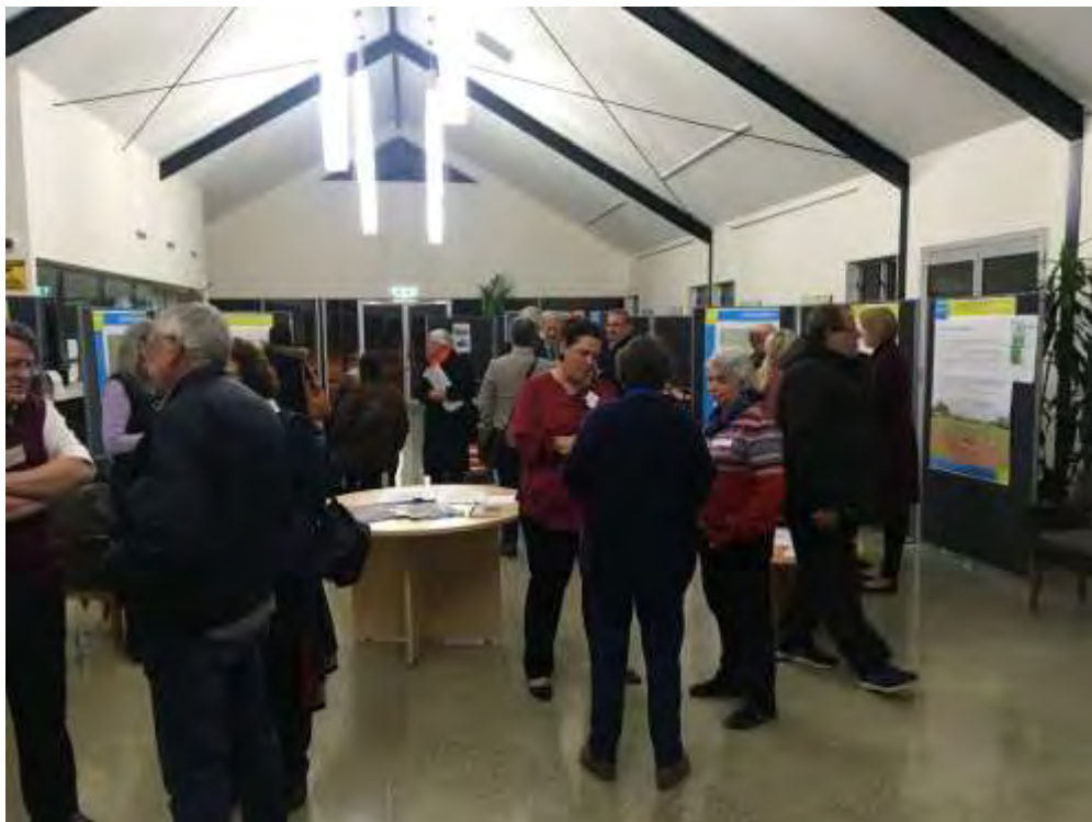
A community information session was held on the Bungendore Structure Plan where community members were able to speak to staff about a range of matters.