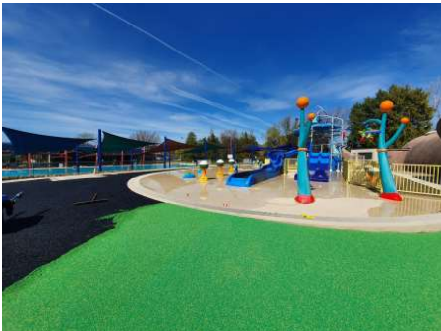
The softfall was extended at the wet play area at the Queanbeyan Aquatic Centre. This improved usability and operations of the area