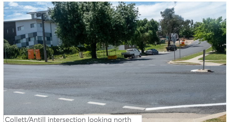
Collett/Antill intersection looking north

The work will reduce the risk of these crashes, improving safety at the intersection by installing stop-signs and line-marking and a new pedestrian refuge island.