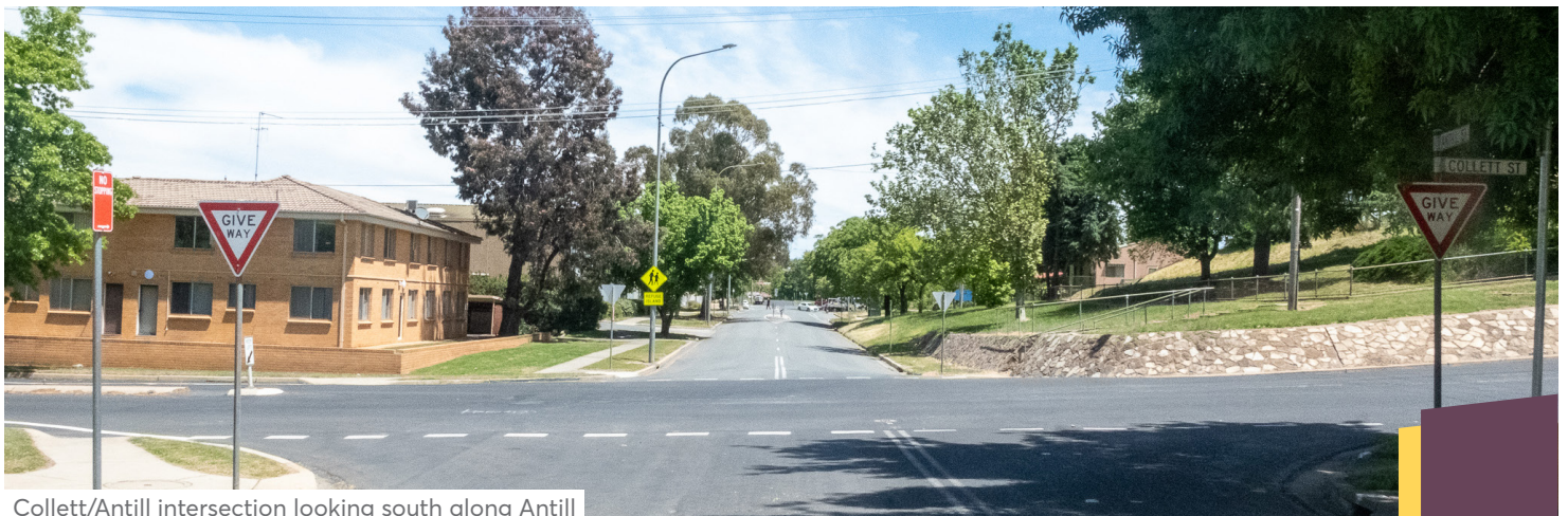
Collett/Antill intersection looking south along Antill

For updates, see the project webpage at: www.qprc.nsw.gov.au/Antill-Collett-Sts