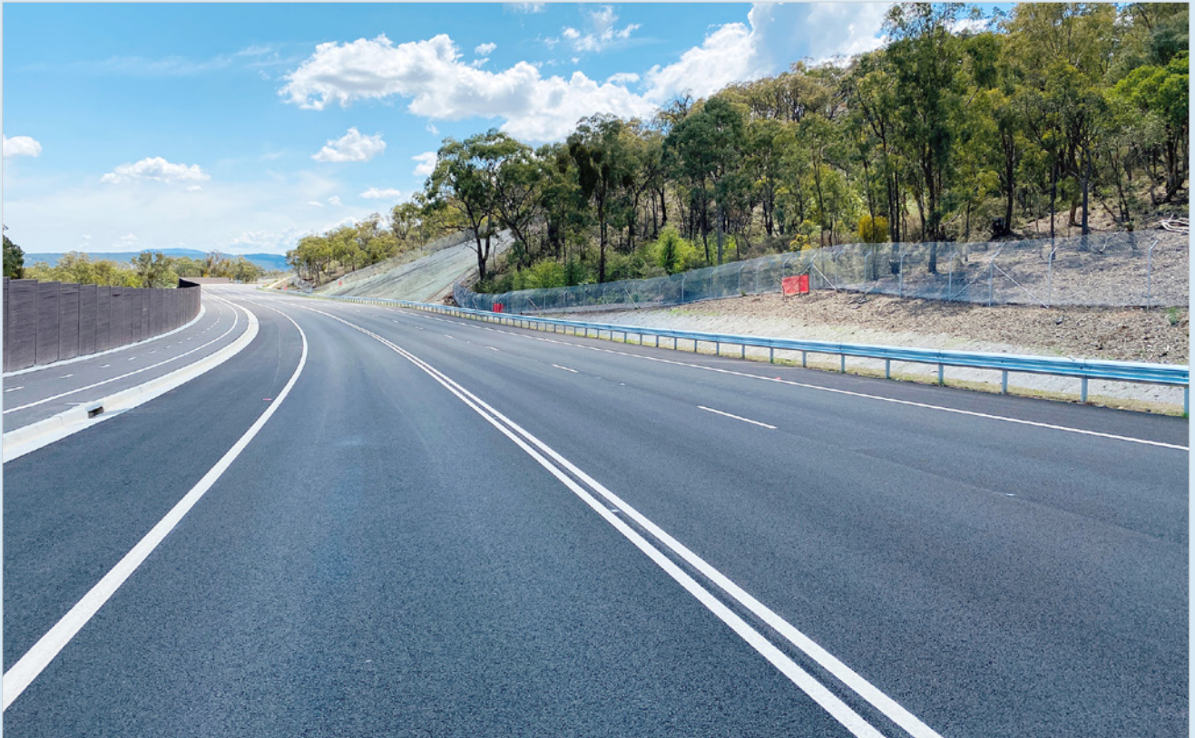
Ellerton Drive extension looking north-west

Pavement work on the existing Ellerton Drive was completed in January 2020. Work to complete the road pavement along the remainder of the extension is nearing completion, including along the shared paths.