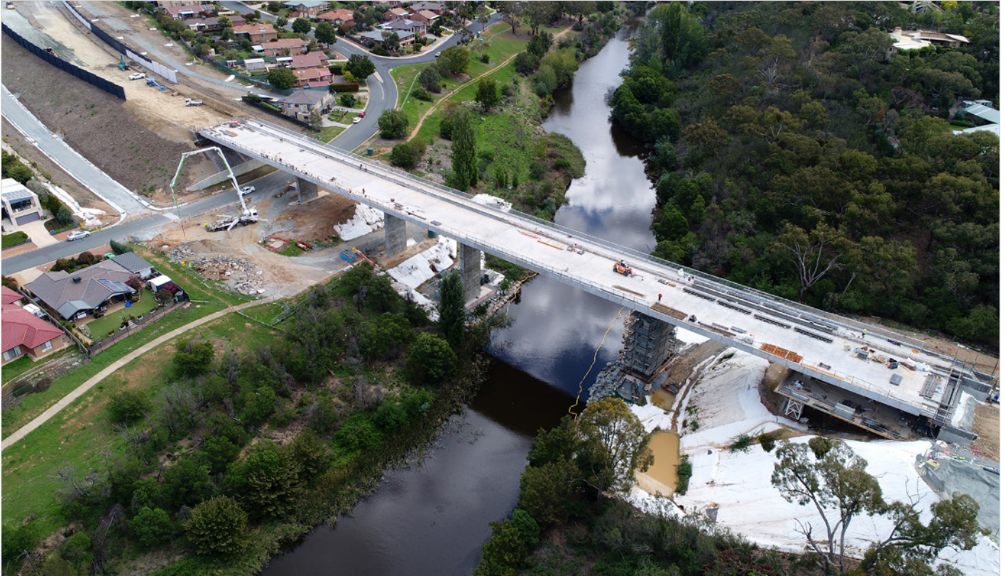
Bridge and road construction underway, looking west along the Queanbeyan River

Work on the bridge has reached a significant milestone with all nine bridge segments now launched across the Queanbeyan River. Work is continuing to complete the bridge deck, install barriers and railings on the bridge and construct the road approaches.