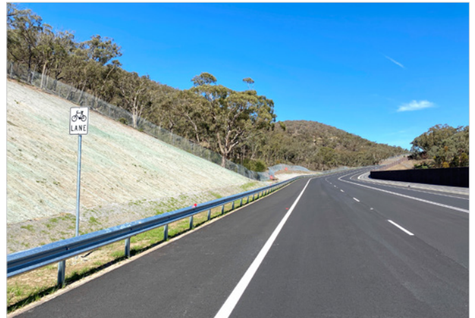
Ellerton Drive extension looking north-west