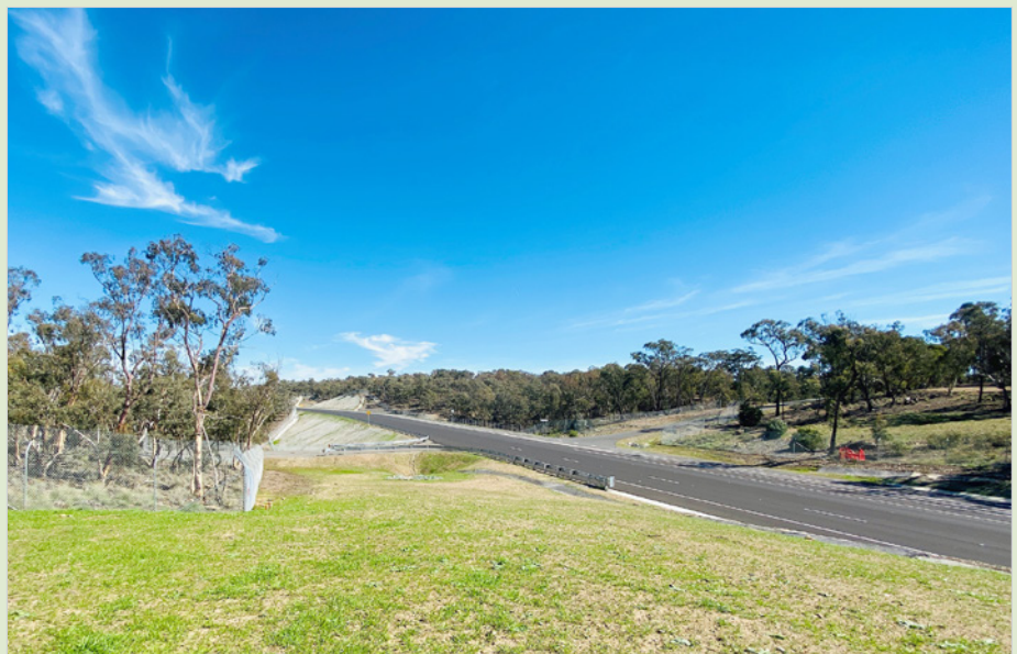
Revegetation work completed along the new road

Landscaping work has progressed significantly in recent months. Tree and shrub planting has started along the southern bridge approach and other locations along the new road. Revegetation work around the banks of the Queanbeyan River and the bridge piers is expected to start this month and will include native trees, shrubs and grasses.