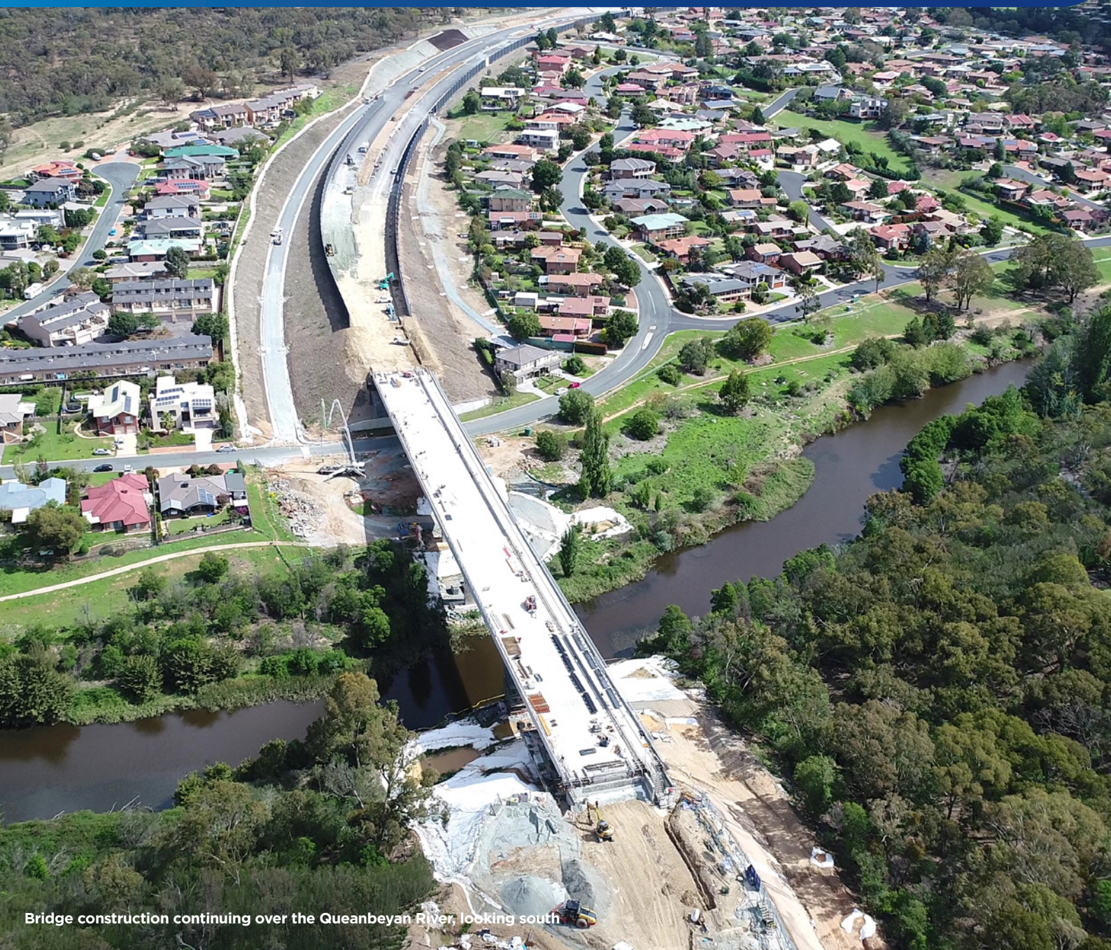
Bridge construction continuing over the Queanbeyan River, looking south