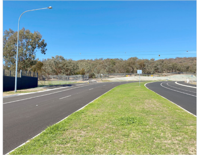
Start of Ellerton Drive extension at Queanbeyan East, with noise walls and fauna fencing complete