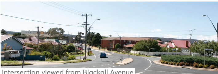
Intersection viewed from Blackall Avenue

At the intersection of Uriarra Road and Stornaway Road, a median island will be installed on Uriarra Road to prevent drivers from turning right from Stornaway Road.