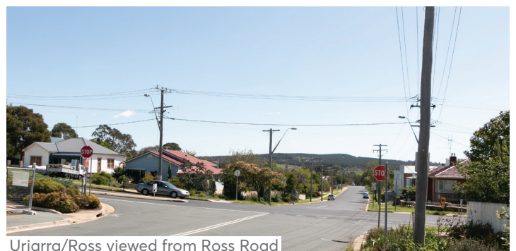
Uriarra/Ross viewed from Ross Road