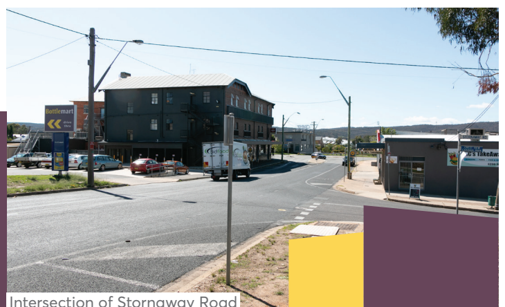
Intersection of Stornaway Road