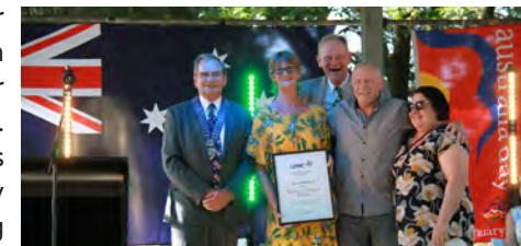
Presentation of the 2020 Queanbeyan Event of the Year - Women of Queanbeyan Calendar

We are seeking nominations for Citizen of the Year, Young Citizen of the Year and Event of the Year for Australia Day 2021 awards. Nominate someone who has contributed to your community this year. Nominations are being sought for Bungendore, Braidwood, Captains Flat and Queanbeyan.