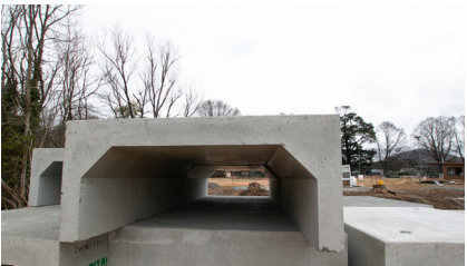
Concrete culverts used to pipe creek at the Braidwood Recreation Ground

We have put together a works program to seal sections of Butmaroo and Majara Streets in Bungendore, seal 600m of Williamsdale Road, extend the Queanbeyan River Path from Dane Street towards Barracks Flat, extend the stormwater pipe at the Braidwood Recreation Ground and additional funding to complete the Lascelles Street upgrade in Braidwood.