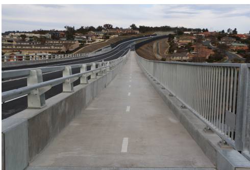
A 2.5m-wide shared path is available the full length of the new Ellerton Drive