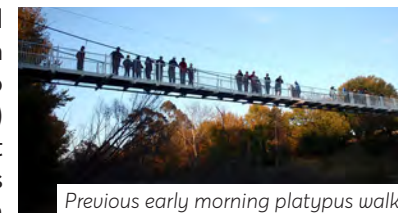
Previous early morning platypus walk

Platypus usually begin to breed around July, but in recent years we have seen some earlier activity in June. We keep track of platypus and rakali (water rat) sightings around the local government area and report to the Australian Platypus Conservancy. Most of our reports are from sightings in the Queanbeyan River, but if you notice activity anywhere else in the local government area, we'd also love to hear about it. Report time, date, location and any photos to platypus@qprc.nsw.gov.au