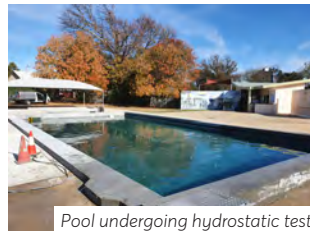
Pool undergoing hydrostatic test

The refurbishment of the Braidwood Pool is progressing well. A significant leak was found in the pool's original expansion joint system. The main pool and wading pool underwent a hydrostatic test which involves filling the pool with water and comparing losses from evaporation and inflows from rain against a control for a certain period. After this, the pool could be drained, and prepared for membranes and final tile installation.