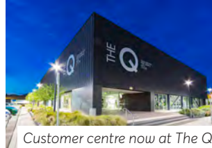
Customer centre now at The Q

Based on the National Cabinet Framework for a COVIDSafe Australia, we've developed plans to reopen our services and facilities as restrictions are eased. Some of these COVIDSafe plans have been implemented, as our customer centres, libraries and Animal Management Facility reopened from Monday 1 June. Distancing markers and protection screens have been installed and no cash payments are being accepted. In Queanbeyan, the customer centre has been moved to The Q, as the most appropriate site where customers and staff will be able maintain physical distancing.