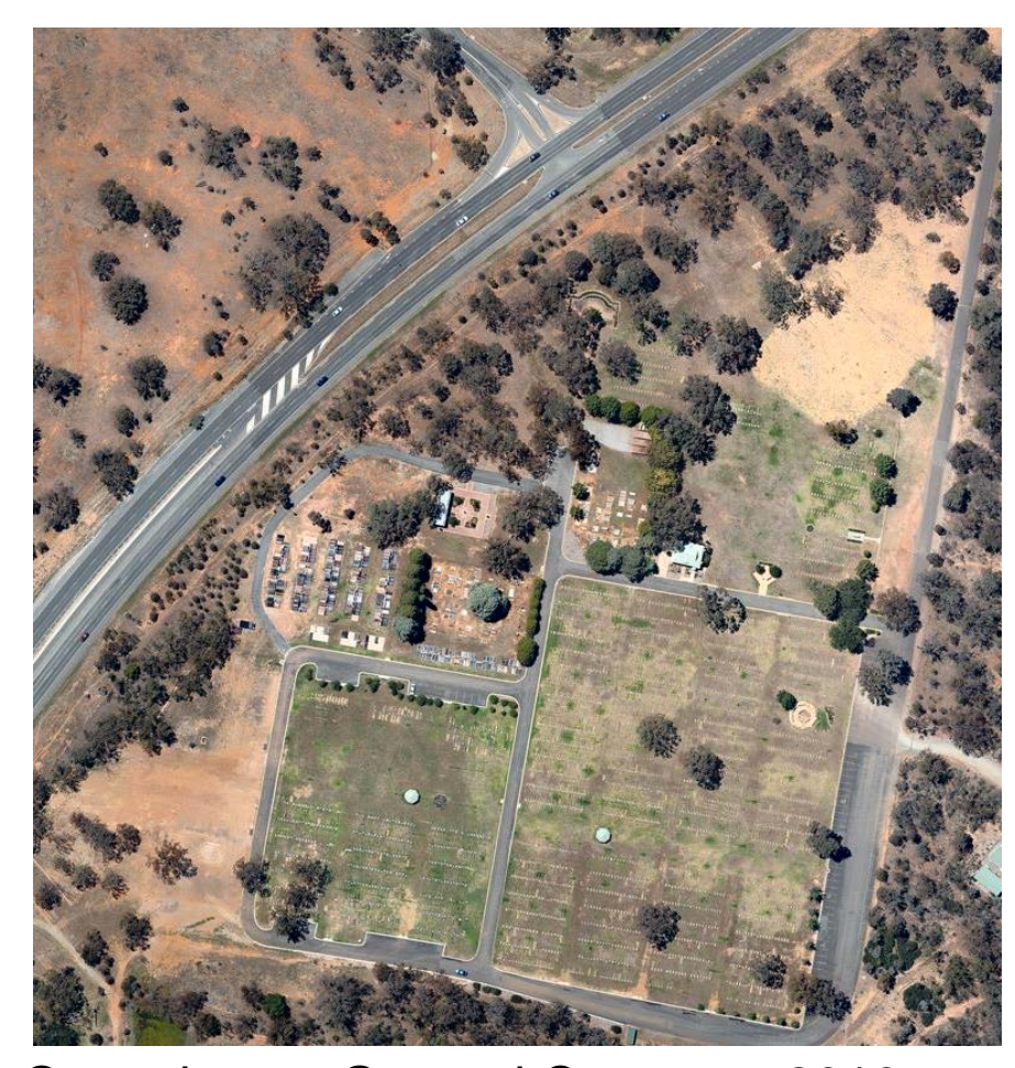
Queanbeyan General Cemetery 2017