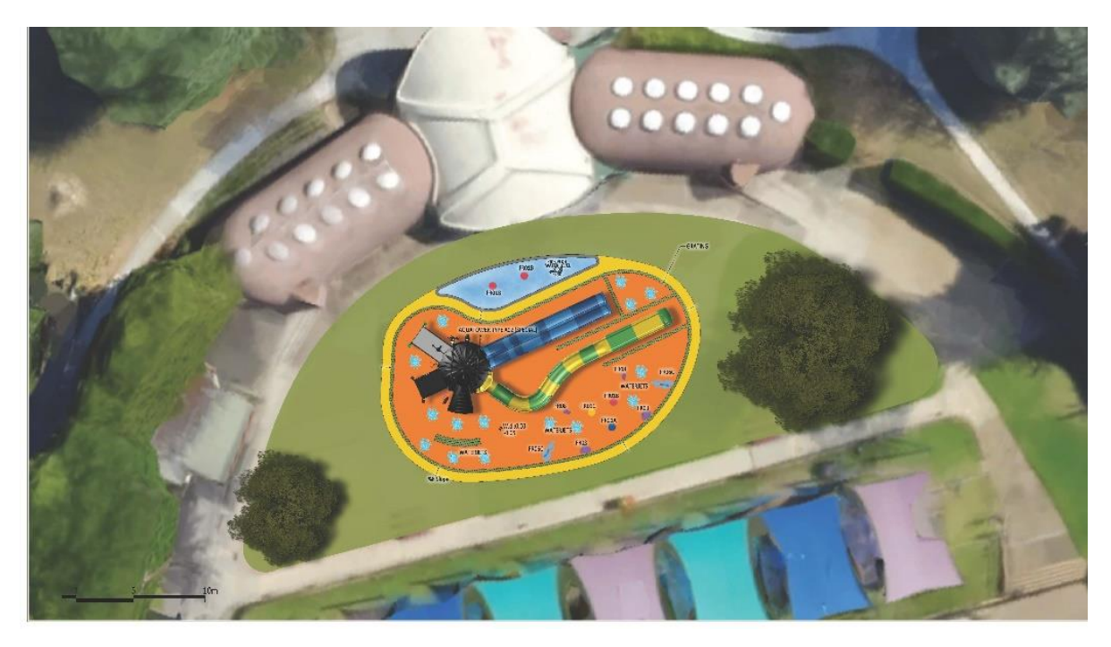
Figure 1: Water Play design with shallow body of water

The wet play area will become a new asset for Council that will replace an existing asset, the Toddler Pool, to be removed prior to project commencement. The proposed cost of the new asset at this stage is $711,285.00, including new pump shed and water play area with associated play structures and infrastructure. Tenderers were asked to provide two options, one with a shallow body of water and one without, i.e. zero depth wet play. Refer images below in this report, Figures 1 and 2.