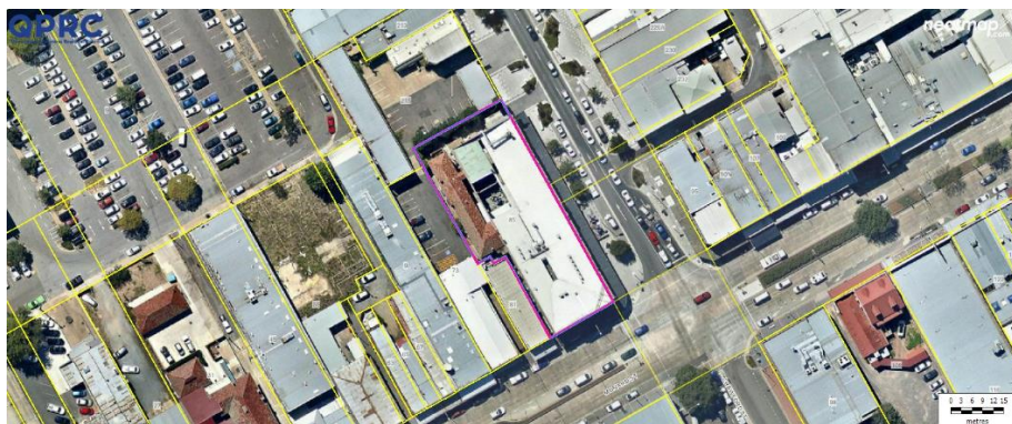
Figure 1: Subject Site

The Royal Hotel is an important landmark building in the CBD of Queanbeyan. The proposed development will preserve the appearance of the building and its pivotal place in the streetscape while at the same time upgrading the first floor facilities to a more compatible use and to modernised standards.