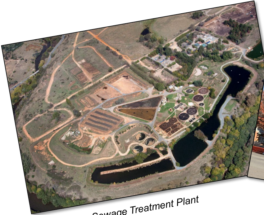
Queanbeyan Sewage Treatment Plant