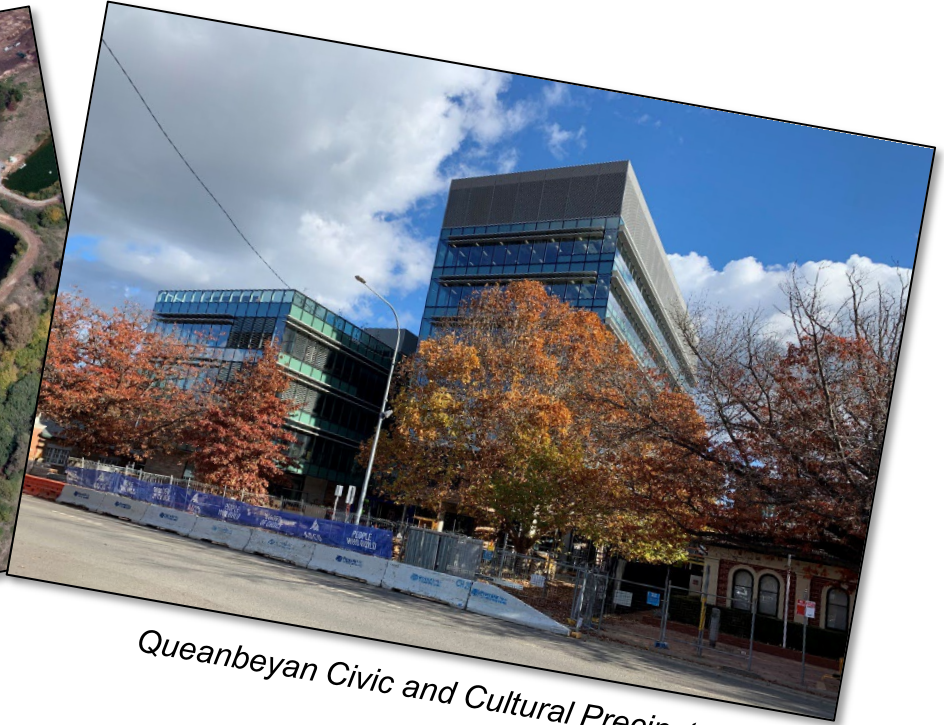
Queanbeyan Civic and Cultural Precinct progress