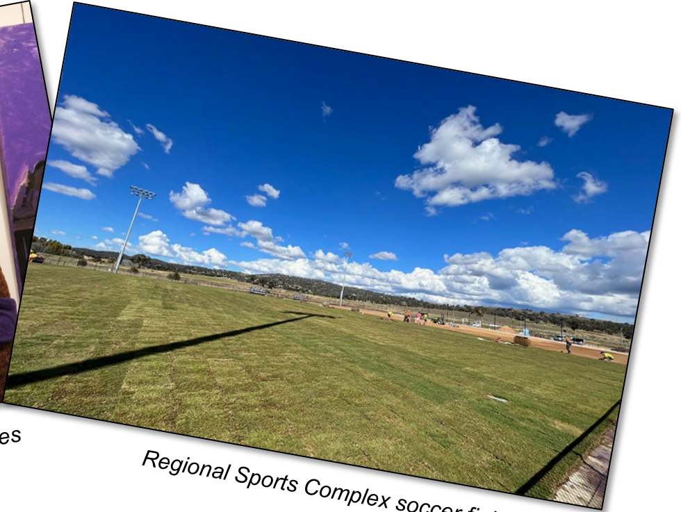
Regional Sports Complex soccer field progress