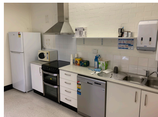
Multiple staff amenities