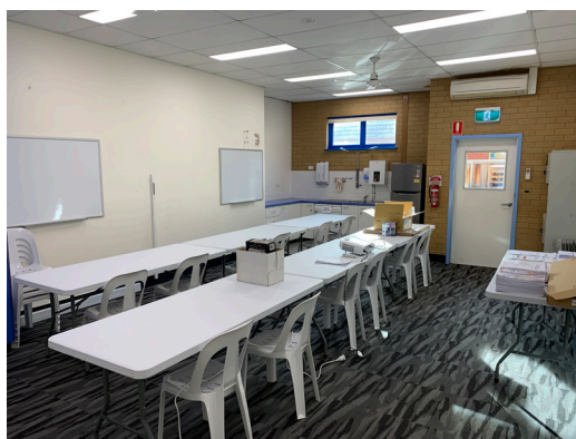
Large open plan areas and offices