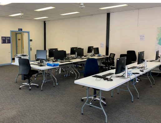
Large flexible open plan office space