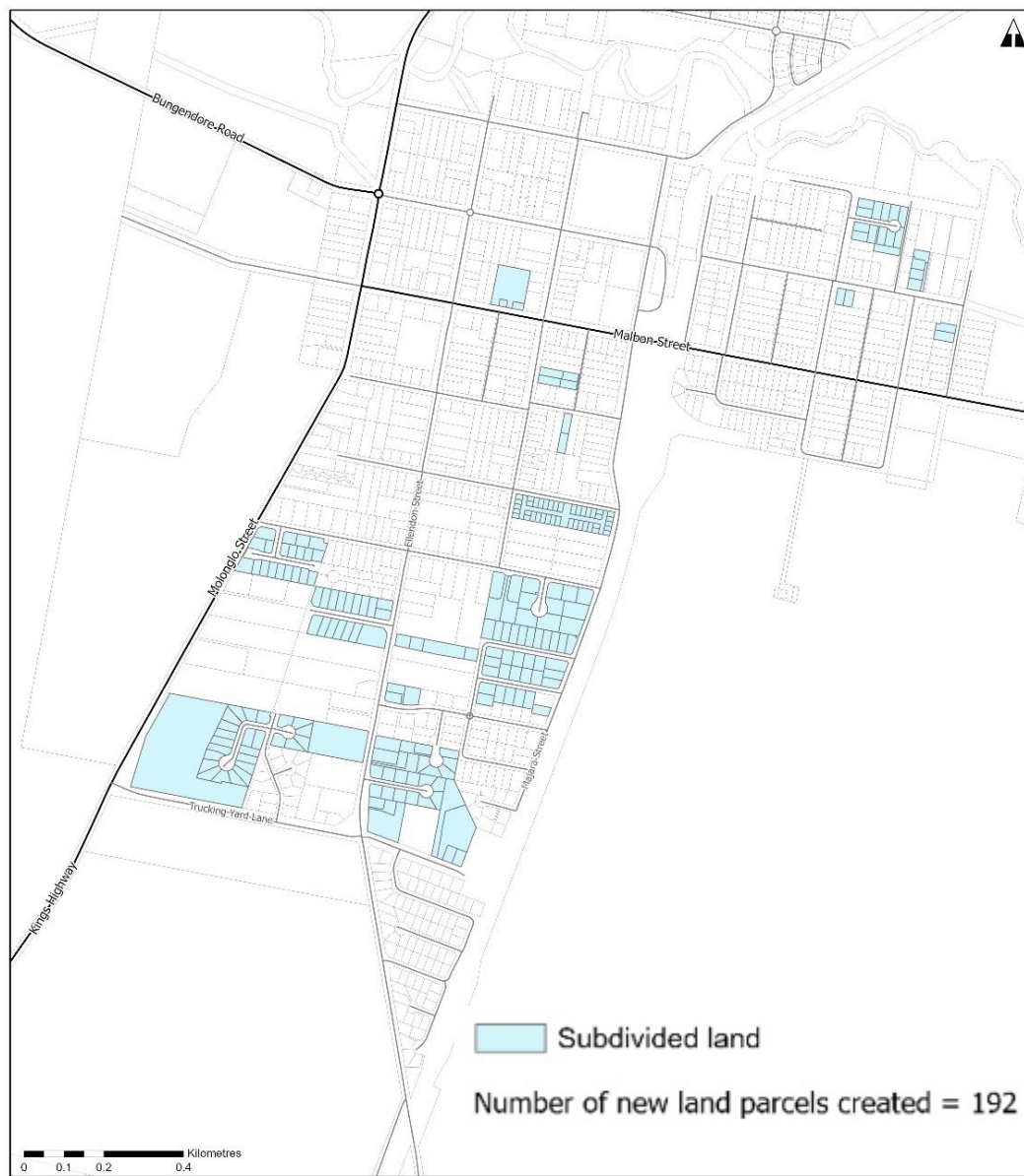
Figure 3L - Bungendore Infill Residential Subdivisions since 2017