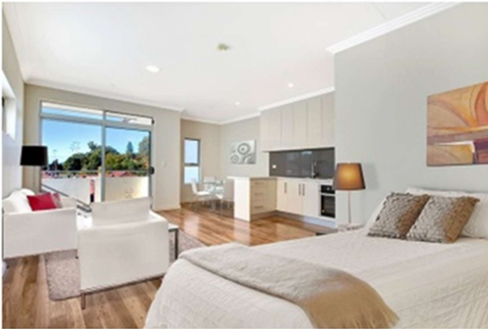
Fig 6: Inside one of the New Generation Boarding House Rooms

Each room features well-appointed living areas, with a fitted fridge/freezer, washing machine and tumble dryer as well as having fitted air conditioning. The 16-20m 2 rooms offer a good-sized bedroom area with built in robes and well-appointed bathroom and kitchen. They each have their own balcony or courtyard, and there is also a common area lounge and a common area garden.