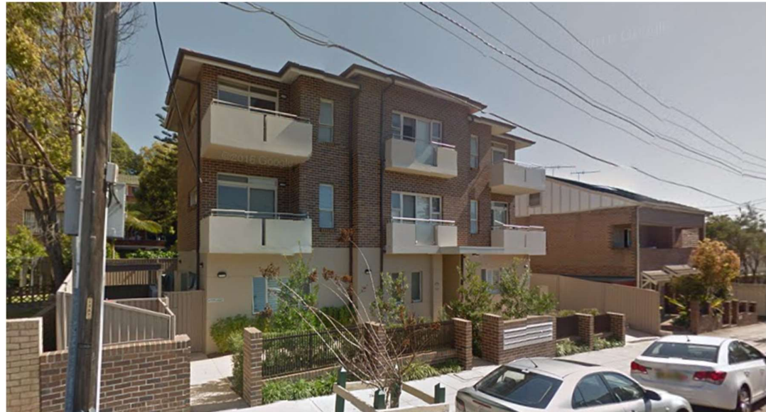
Fig 5: Pembroke Street, Ashfield (pictured below)

In 2014, the private developer successfully completed the development of the 20 room ‘New Generation’ boarding house in Summer Hill. It is managed to a high standard by Hume Community Housing and their on-site manager. Hume Community Housing is proactively managing the property with regular inspections, block meetings and customer wellbeing visits as well as the provision of an on-site manager.