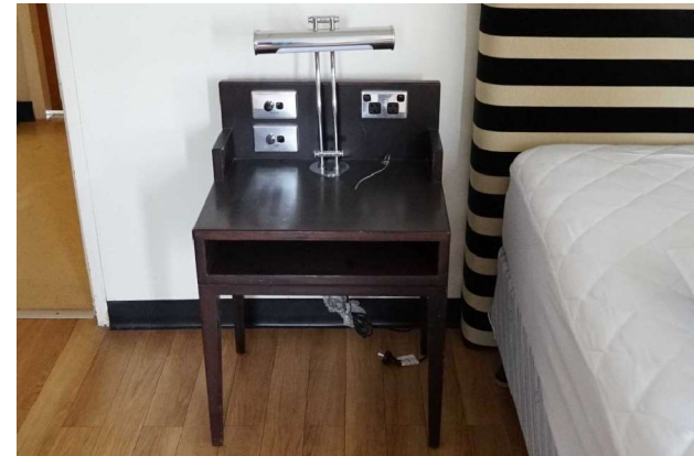
Pictured above: A lot of the furniture used in the pop-up homeless shelter was donated by a large hotel chain

"If there is other buildings that are going to go under demolition and they can opt to help people for three to six months, a year [they, should]," she said. "This is a good place, and we all feel safe — it's a safe haven for us."