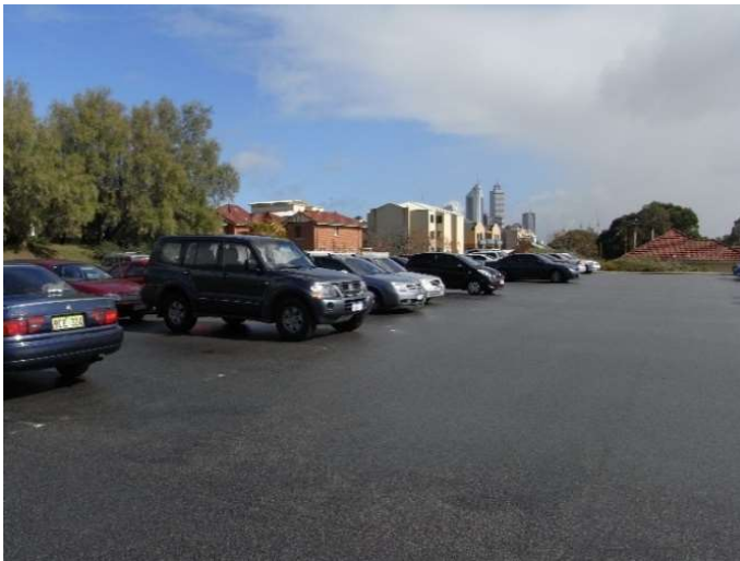
Fig 2: A City of Perth Car Park identified for a future Affordable Housing Development

In 2012/13, it undertook the redevelopment of the first of these car parks to construct 48 units of affordable housing, mainly allocated to locally-employed 'key workers' at discount market rent (around 70% of market rent for that precinct). Four of these units were initially allocated to social housing, where very low income households pay around 25% of their income in rent, with more units planned to be dedicated to social housing as debt is retired.