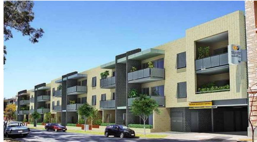
Fig 1: City of Perth Affordable and Social Housing Development, managed by Access Housing

In 2009, City of Perth adopted its first Affordable Housing Strategy 1 , which included a commitment to proactively develop well-located affordable housing on under-utilised Council land. The research for the Strategy had identified 16 Council car parks with the potential for mixed use development, including commercial or community uses, affordable housing and replacement of car parking spaces. Council resolved to dedicate three of these high value, but financially under-utilised assets, to affordable housing.