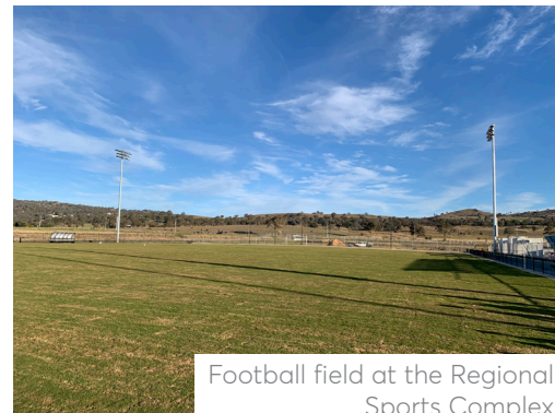
Football field at the Regional Sports Complex

The draft documents have been on public exhibition since early May and the final documents will be adopted at the Council Meeting on 28 June. The final documents will consider all the feedback collected via Your Voice, at community meetings and other submissions.