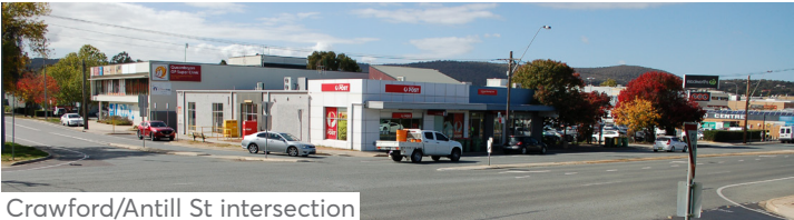
Crawford/Antill St intersection

At stages during the project, the footpath will be closed, and a detour for pedestrians will be in place. Please observe detour signs and follow directions of traffic controllers.