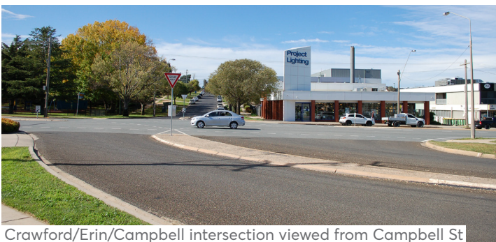
Crawford/Erin/Campbell intersection viewed from Campbell St

During construction of Stage 1, Antill Street will be closed west of Crawford Street. Detours will be in place and access to all properties and driveways near the intersection will be maintained throughout construction.